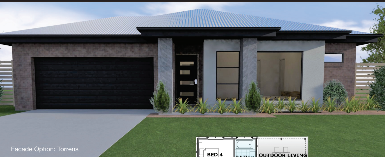
Facade Option: Torrens